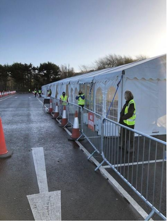
NHS vaccine station set up in Maer Road

As we all started learning to live with covid, the extent of difficulties caused by the pandemic and the emerging national cost of living crisis became increasingly apparent.