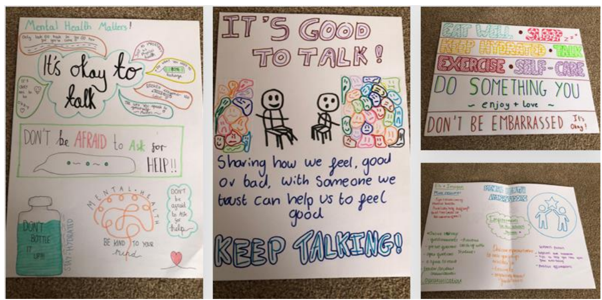
Feedback from mental health ambassador work in primary school.