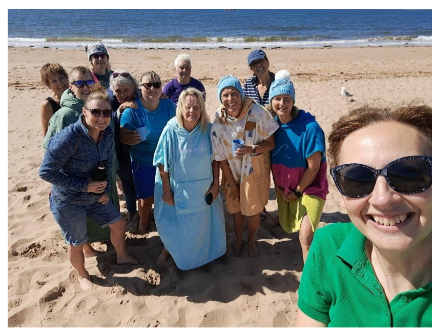
Swim To Sea class for adults, Exmouth.

"There are a lot of things people can do themselves which will delay the point where they first have disability and then multi-morbidity. They are old-fashioned things, actually. Having lots of exercise, having mental stimulation and a social network, eating a reasonably balanced diet (with) not too much high fat, sugar and salt, moderating alcohol, stopping smoking if you do – these are things which are old fashioned, but they still work." Chris Whitty [2023]