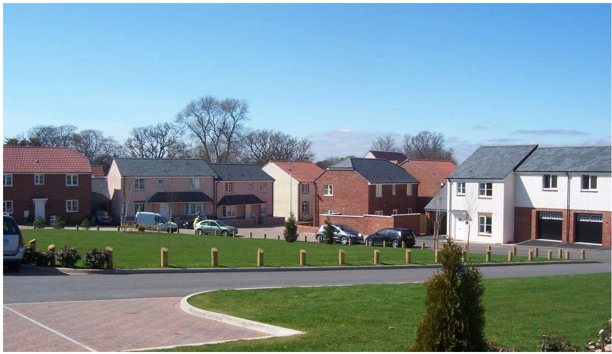
New houses in Cranbrook.

Population growth was higher in East Devon than across the South West. The population is diverse in its age-distribution: for example Cranbrook has a particularly young population while Budleigh has unusually high numbers of centenarians.