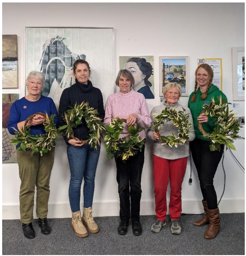
Wreath Making session from a project in partnership with Devon County Council's Natural Environment Team.

We recognise that we cannot achieve all of our aspirations alone and that our work requires close partnerships. We will continue to strengthen these, by aligning and sharing knowledge, skills and resources to achieve the population health outcomes to which we aspire. We will maximise partnership working at a strategic level to identify priorities, extend reach, align resources most effectively to avoid duplication and respond to local need.