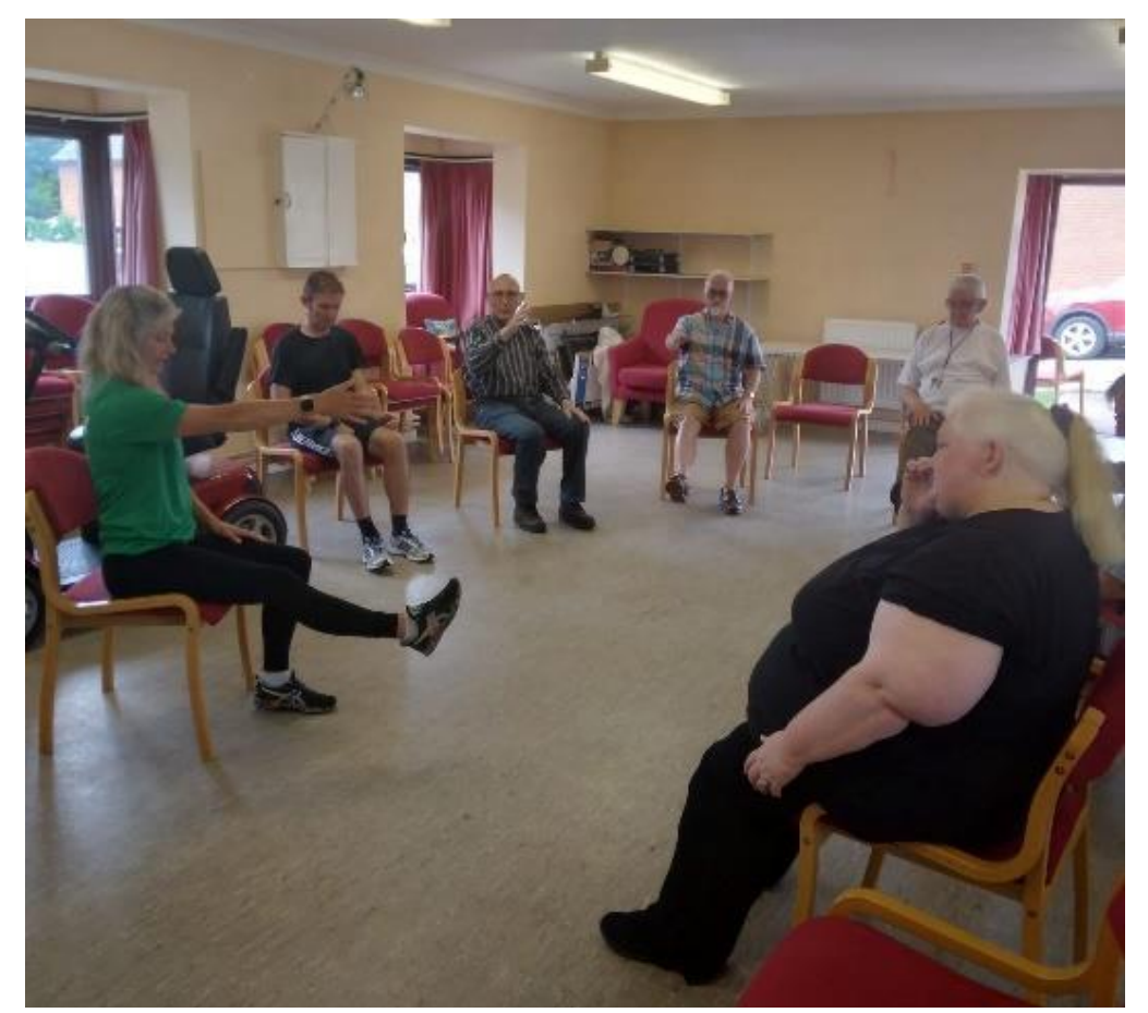
Community Instructor with Stroke Survivors Group in Littleham.

This could include social prescribing, seen as a way to connect communities with nonmedical interventions and to find their own way to being healthier, happier and connected.