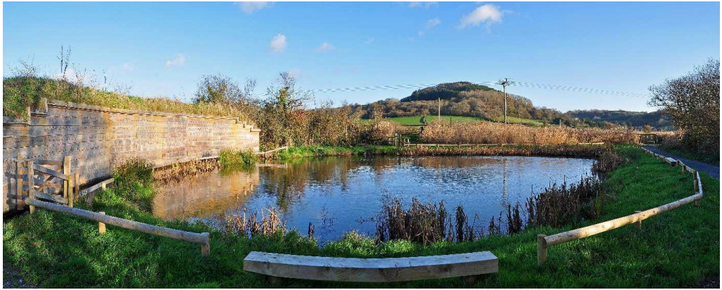
Seaton Wetlands

We will work alongside our many partners to meet our shared goal of a healthier, happier and greener future. We will help to create and protect local networks of places that are good for wildlife and people. We will deliver this on our own land and encourage landowners to follow our example.