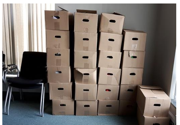
Government emergency food boxes for onward distribution, and

During this phase we forged stronger links with many community and third sector groups as well as with the County Council and other District Councils.